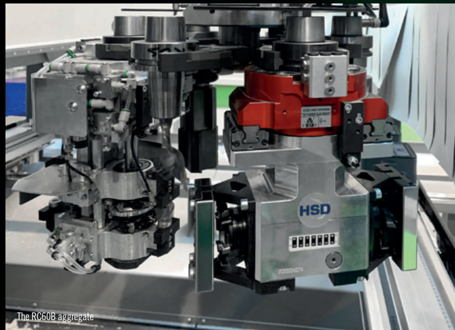
The RC60B aggregate