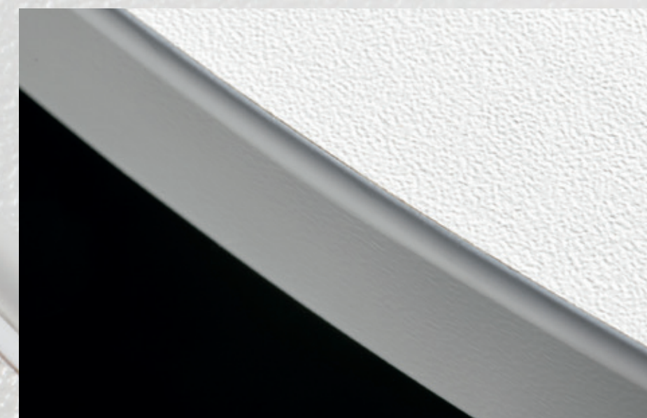
Internal and external radii edged with EVA.

side as the electro-spindle, resulting in a narrower head and making it possible to machine and edgeband a full three-metre panel. There have also been some significant developments in the bed systems that are now available: "We have four levels of table setup system," says Paul, "Manual; Setup Assist (where the red and green lights tell you where to put the pods); EPS (where you press the button and the pods move automatically into position but any manual movement after they've been set requires the bed to be re-homed); and the very latest FPS 'Feedback Positioning System'. FPS homes the pods to start with and regardless of whether they are moved manually afterwards, the feedback system knows where they are and moves them into the correct position for the job it's about to perform.